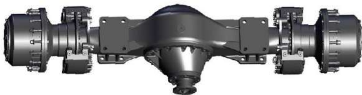
钳盘桥 caliper disc axle